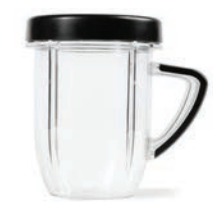
short cup with lip ring