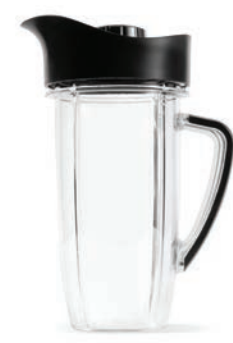
oversized cup with pitcher lid