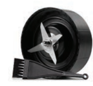
extractor blade with cleaning brush