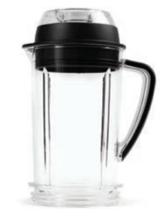
34 oz souperblast pitcher with 2-piece lid